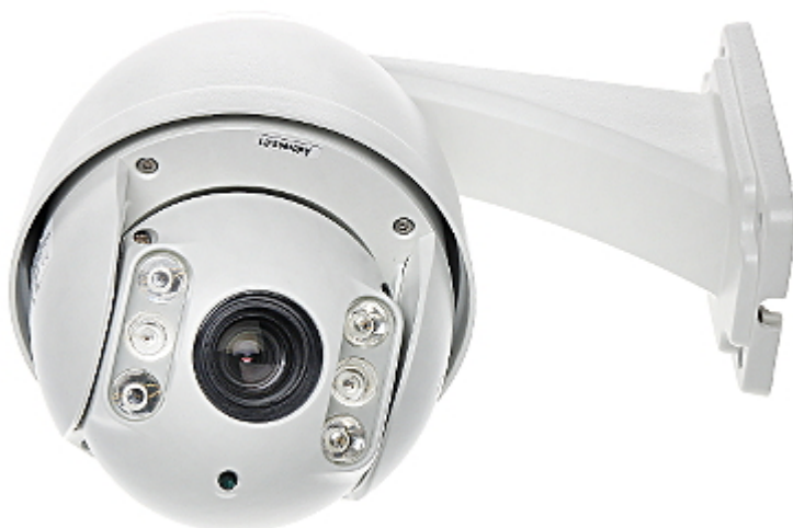
Small dimensions camera: