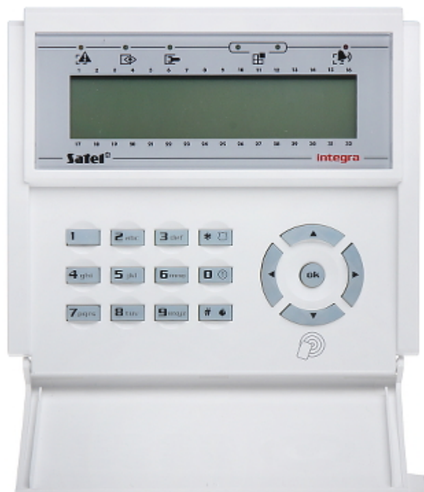
View after open the cover: