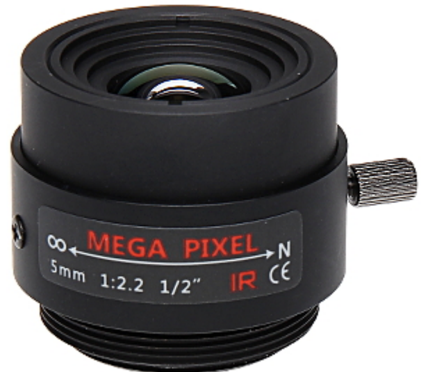
Fixed-focal lens with CS mounting type designed to megapixel cameras.

The device must be secured against contact with caustic, staining and viscous fluids.