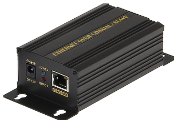
The 15-EOC101S transmitter for Ethernet transmission via coaxial cable.

To return a worn-out product, use a collection and disposal system of this type of equipment or contact a seller from whom it was purchased. He will then be recycled in an environmentally-friendly way.