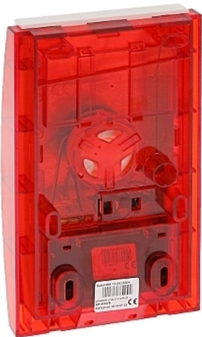
Description of particular elements of the device: