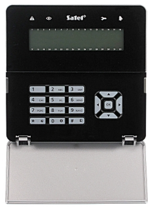
View after remove the cover: