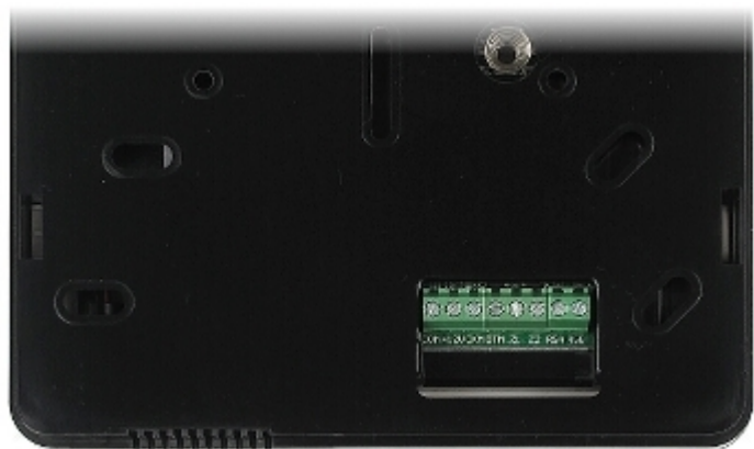
View after remove the cover: