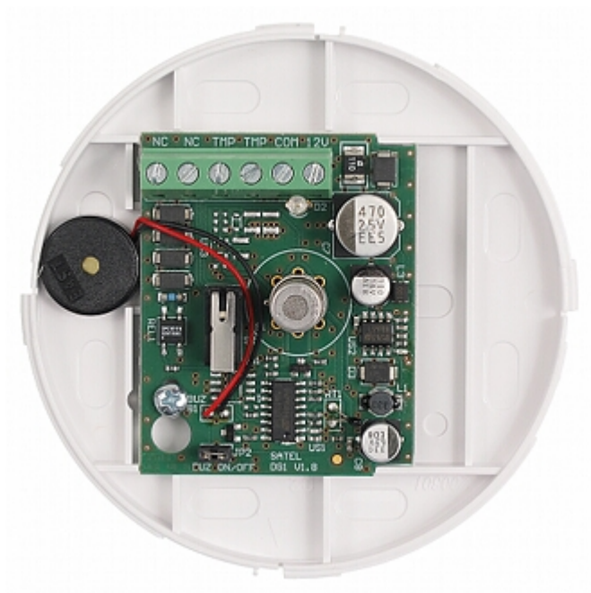
Rear view + additional kit elements: