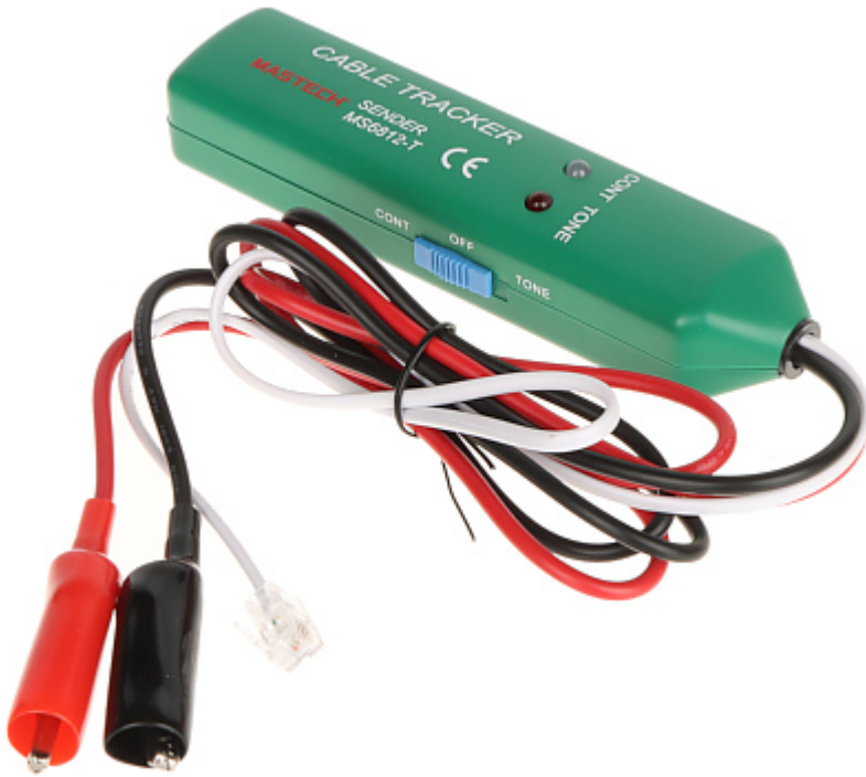
Rear view (place for battery):