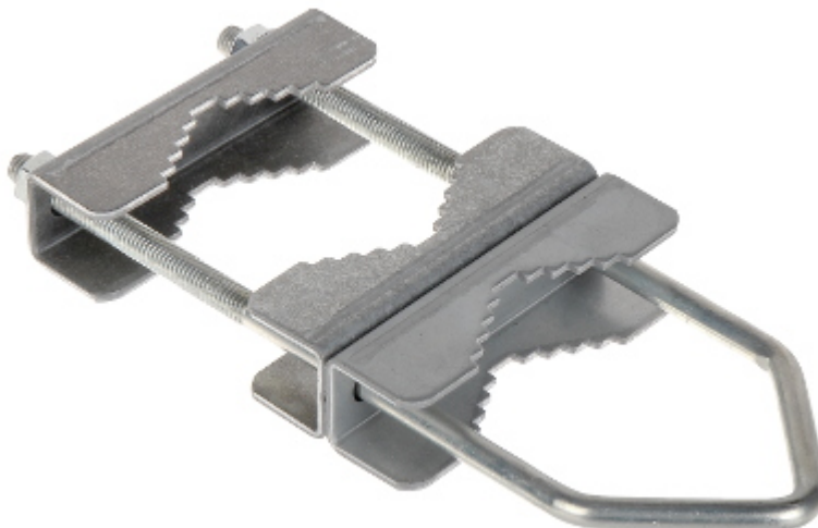
Clamp to mount two masts parallel to each other.

The device must be secured against contact with caustic, staining and viscous fluids.