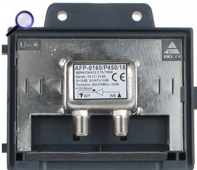
Characteristics of the amplifier with filter: