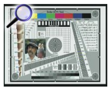
For VGA 1024x768 resolution