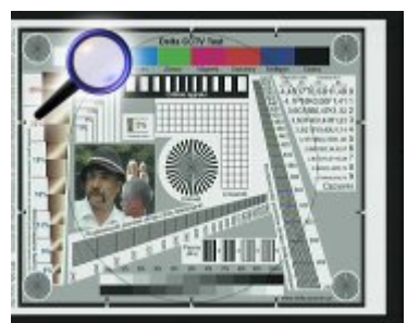
For VGA 800x600 resolution

Code: AX-2000 VGA-VIDEO CONVERTER AX-2000