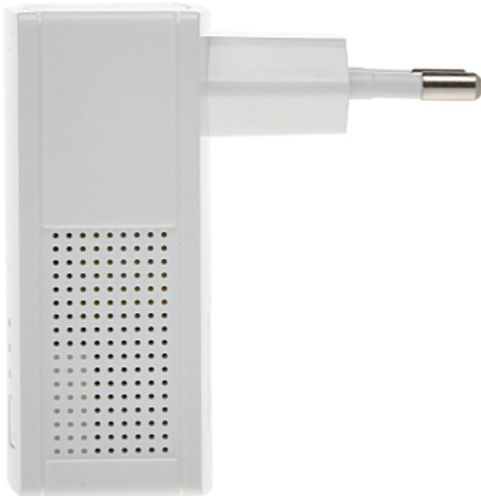
Typical operation diagram: