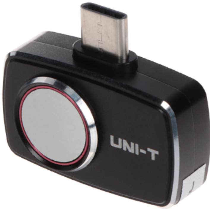
Small dimensions camera: