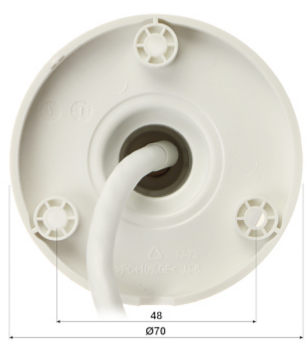
Camera mounting dimensions:

Code: DS-2CD1063G2-LIU(2.8MM) IP CAMERA DS-2CD1063G2-LIU(2.8MM) ColorVu - 6 Mpx Hikvision