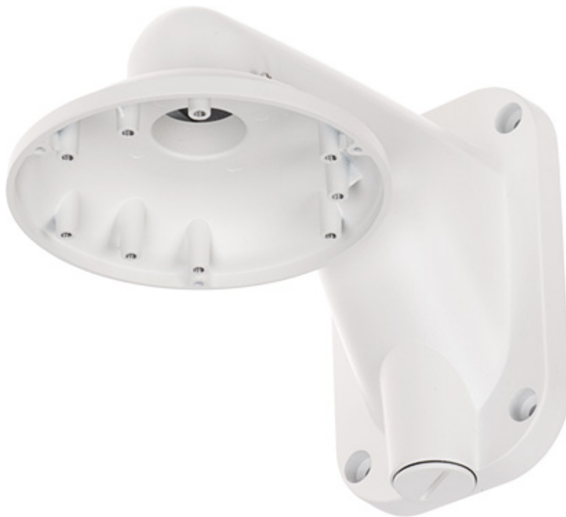
Wall bracket. For outdoor use.

The device must be secured against contact with caustic, staining and viscous fluids.