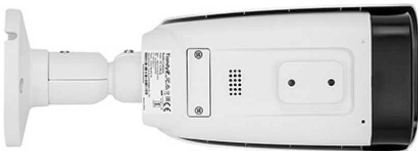
Memory card slot and "Reset" button: