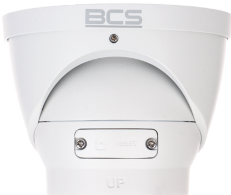
Camera is out from clamping ring: