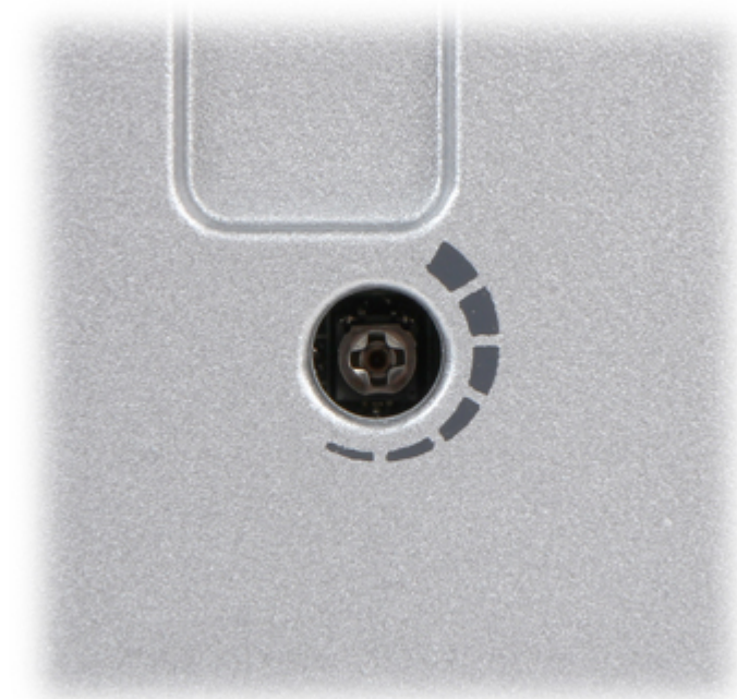
Door station: Front panel: