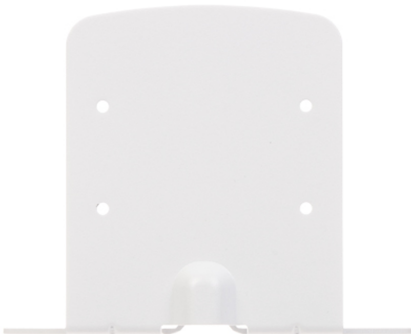
View of the ceiling mounting side: