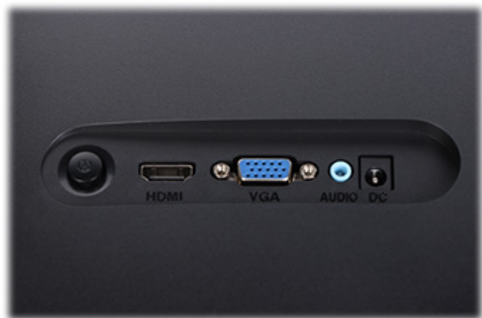
In the kit: