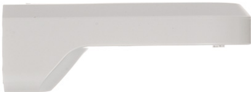
Elements of the bracket: