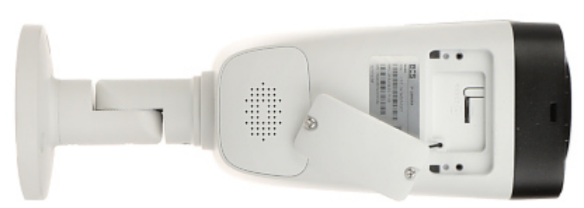
Memory card slot and "Reset" button: