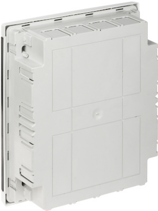
In the kit: