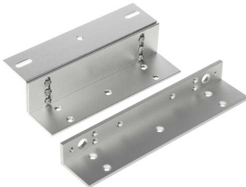
Z-bracket and L-bracket set for the JS-280W electromagnetic lock with load capacity of 280 kg.

The device must be secured against contact with caustic, staining and viscous fluids.