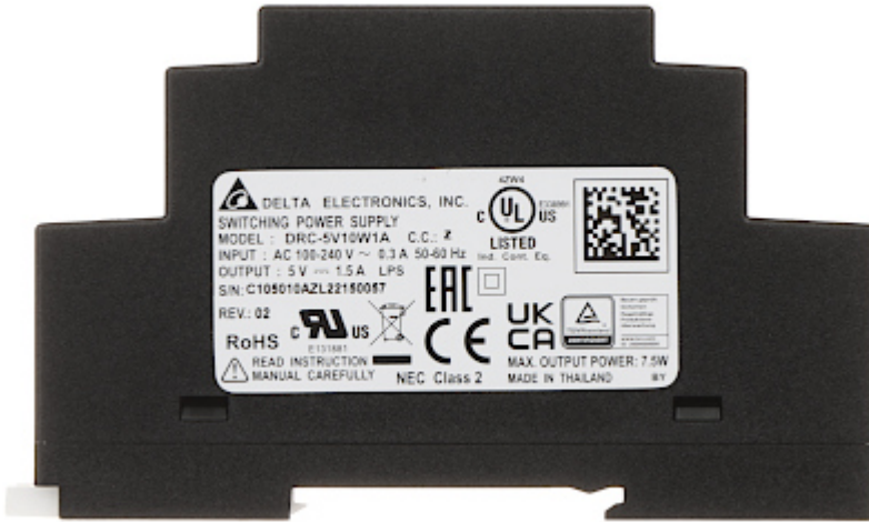
Rear panel (DIN rail installation):