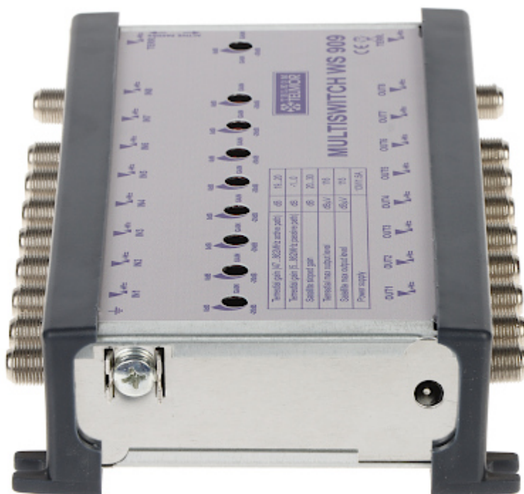
In the kit: