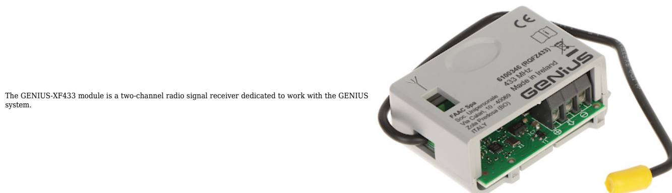
The GENIUS-XF433 module is a two-channel radio signal receiver dedicated to work with the GENIUS system.

To return a worn-out product, use a collection and disposal system of this type of equipment or contact a seller from whom it was purchased. He will then be recycled in an environmentally-friendly way.