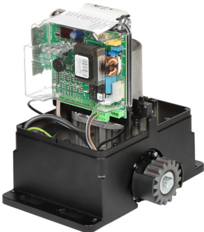
Gate controller connectors: