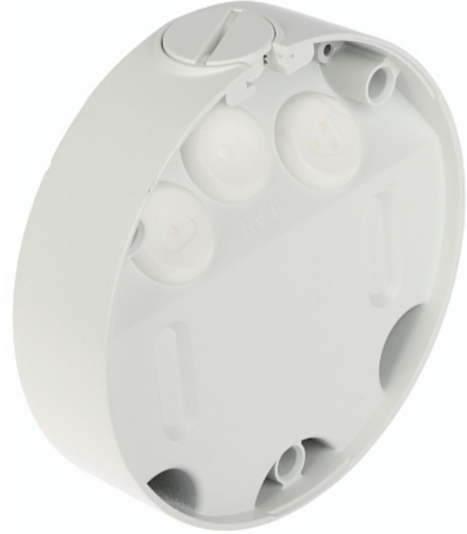
Camera and bracket dimensions: