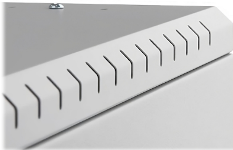
Blind cable entries: