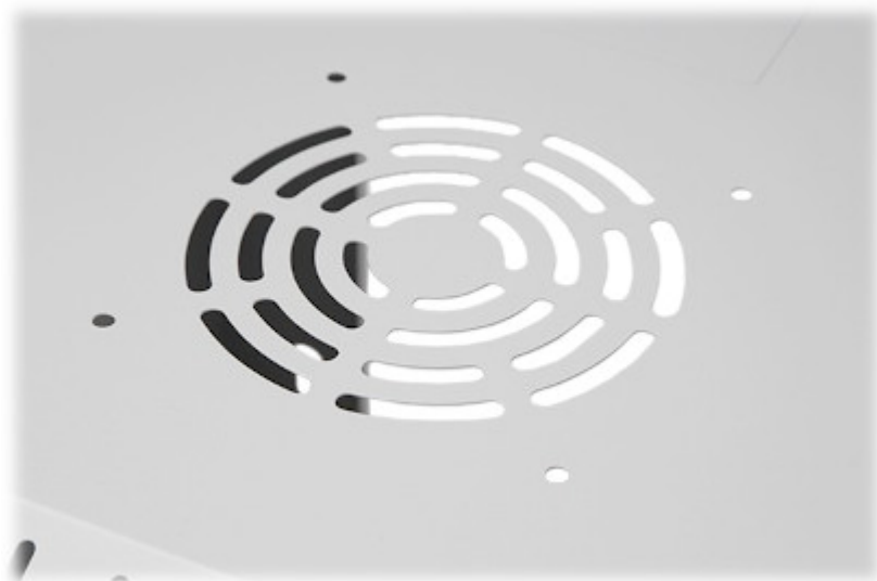
Ventilation holes on the front of the housing: