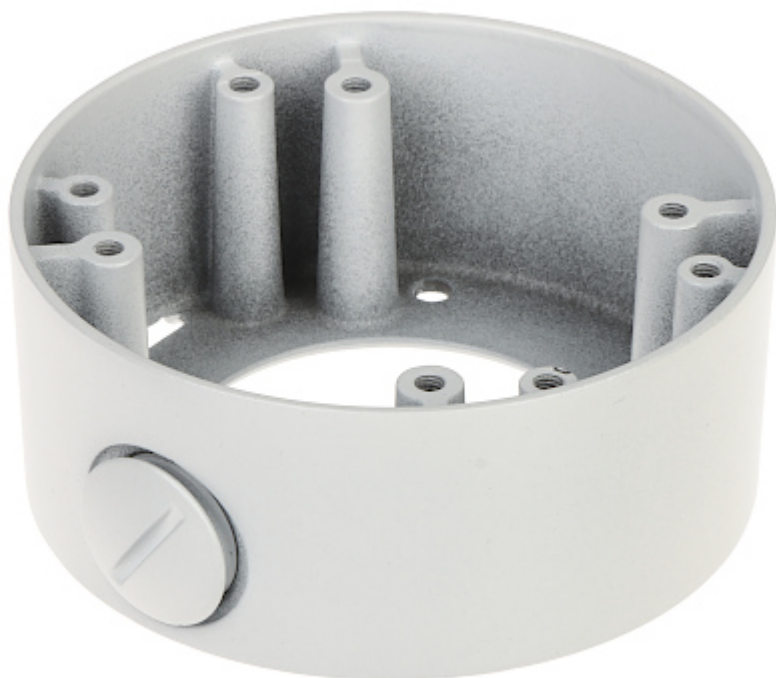
View of the ceiling mounting side: