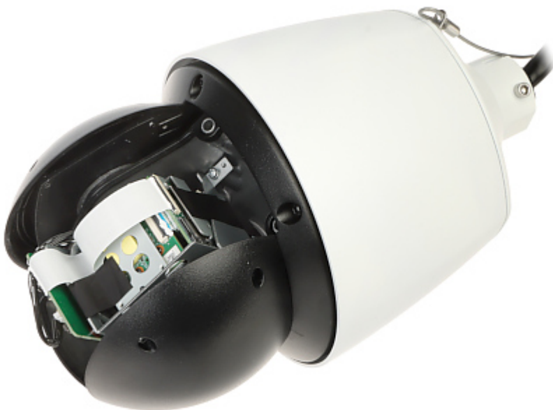
Micro SD card slot is located inside the camera: