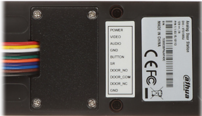
INDOOR PANEL: Mounting side view: