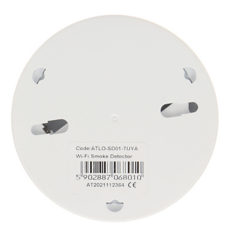
Place for batteries 2 x 1.5V AAA:

Code: ATLO-SD01-TUYA WIRELESS SMOKE DETECTOR ATLO-SD01-TUYA Wi-Fi, Tuya Smart