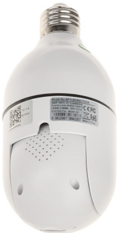
Memory card slot, micro USB and "Reset" button: