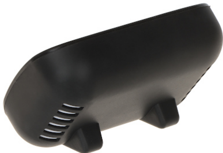
The device is secured with a silicone case, which also serves as a stand: