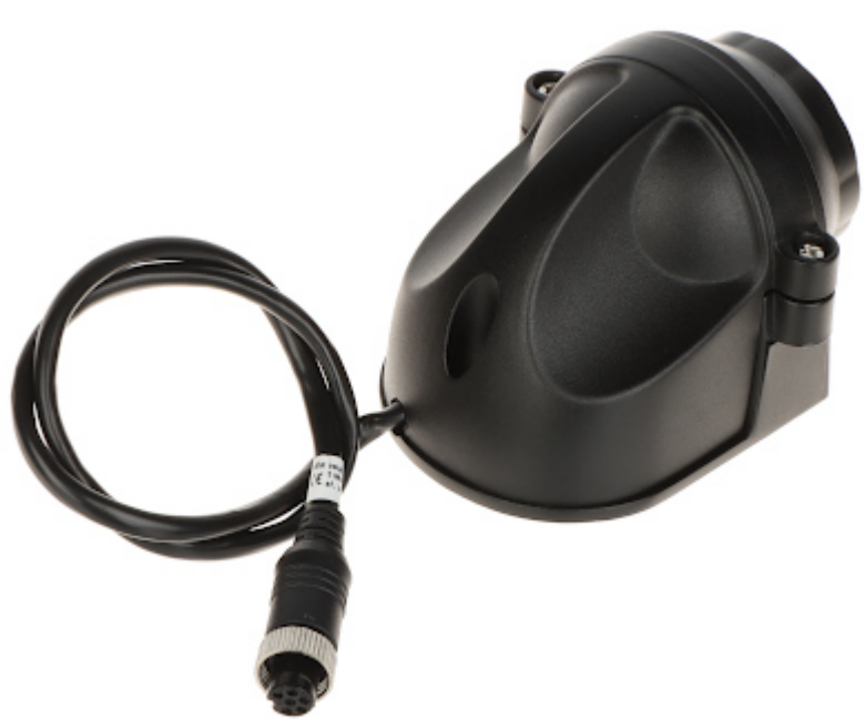
Camera mounting dimensions:

Code: ATE-CAM-IPC765 IP MOBILE CAMERA ATE-CAM-IPC765 - 1080p 2.8 mm AUTONE