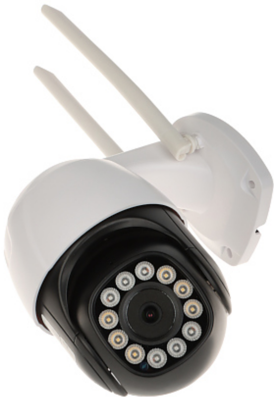
Memory card slot: