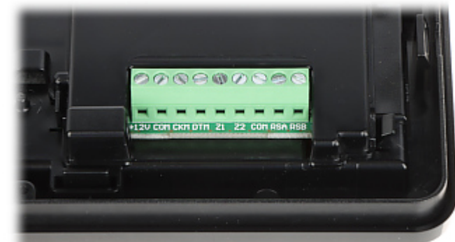
In the kit: