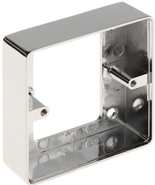
Surface-mounted box dedicated to mounting ATLO door opening buttons.

The device must be secured against contact with caustic, staining and viscous fluids.