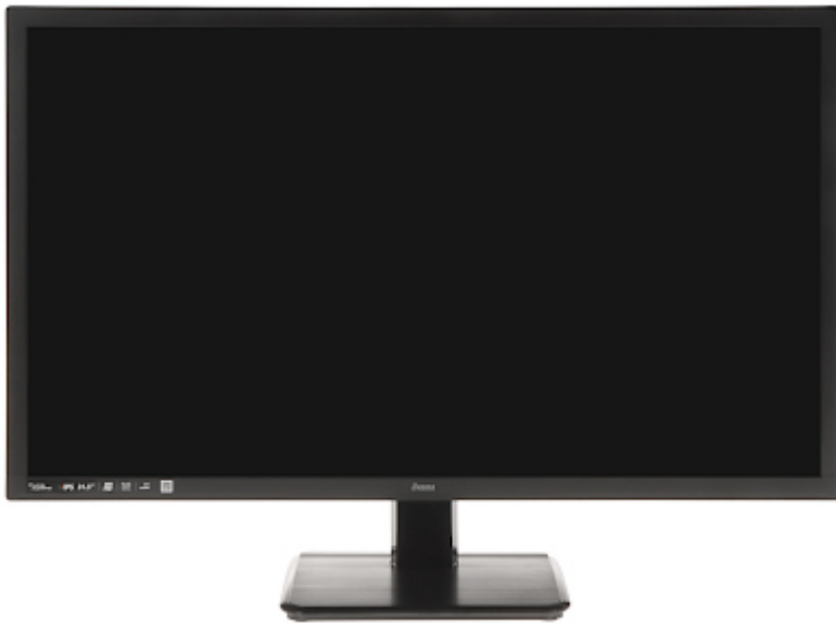
OSD menu control keys: