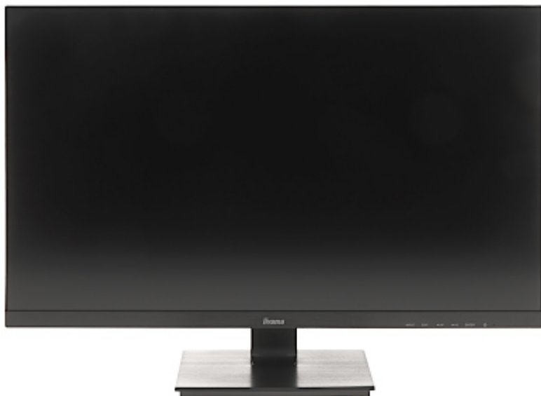
OSD menu control keys: