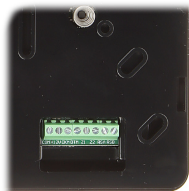
View after remove the cover: