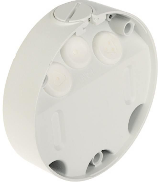
Camera and bracket dimensions: