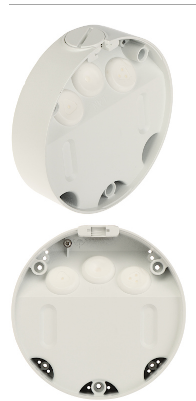
Camera and bracket dimensions:

Code: DS-2CD2686G2-IZS(2.8-12mm) IP VANDALPROOF CAMERA DS-2CD2686G2-IZS(2.8-12mm) - 8.3 Mpx - 4K UHD - MOTOZOOM Hikvision