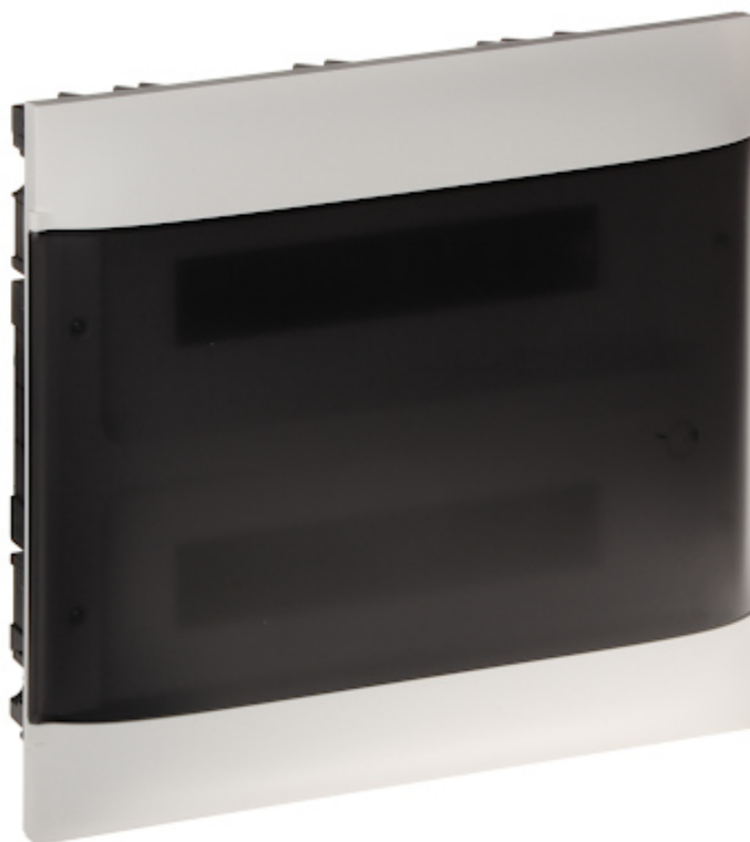
2-row 36-modular flush-mounting distribution electric cabinet.

The device must be secured against contact with caustic, staining and viscous fluids.