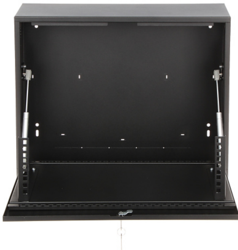
RACK 19" mounting rails: