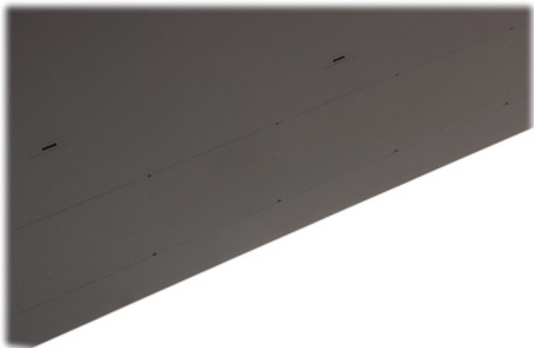
Holes for fan coolers: