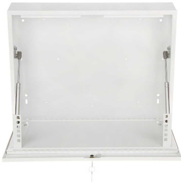
RACK 19" mounting rails: