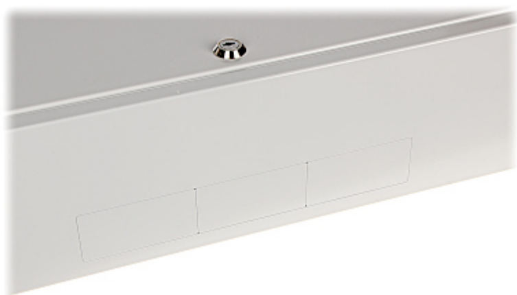
Holes for fan coolers: