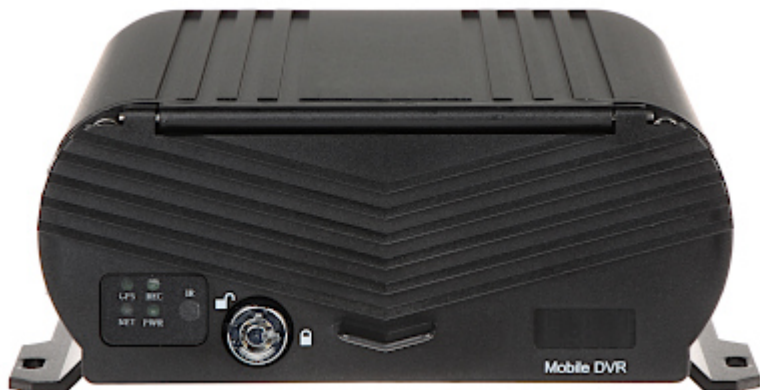
View after open the front cover: